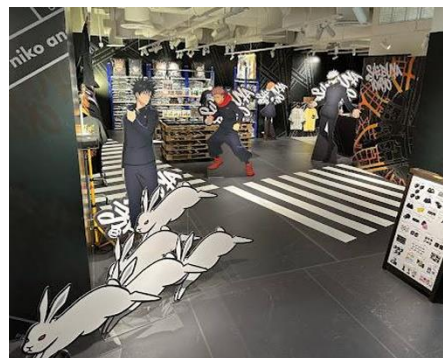
Thailand: Jujutsu Kaisen