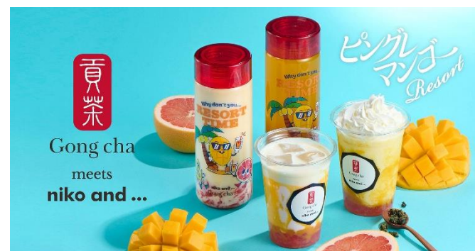
Gong cha's bottle is designed by niko and ...