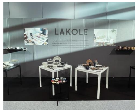
U.S. : LAKOLE's exhibition in New York