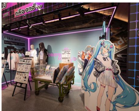
Mainland China : New & Retro Hatsune Miku