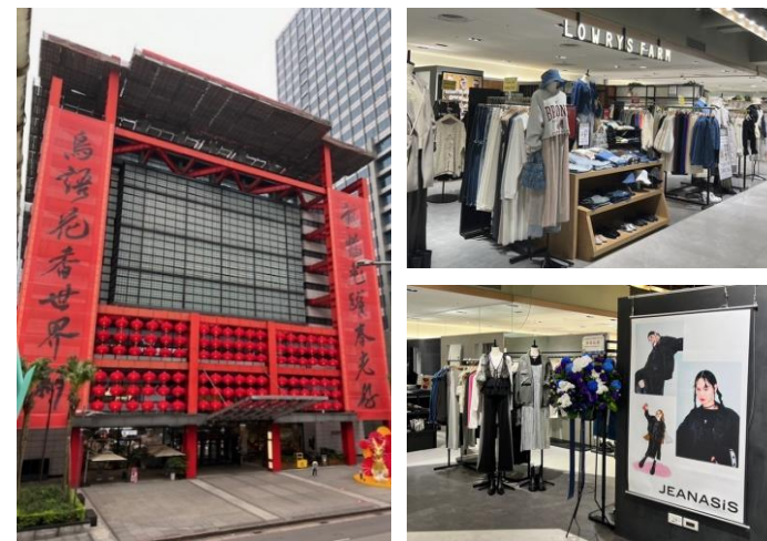
Taiwan; Shin Kong Mitsukoshi