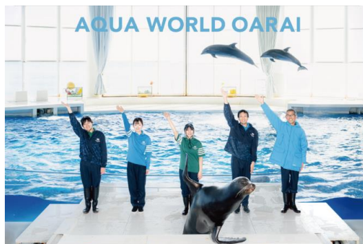
Aqua World Ibaraki Prefecture Oarai Aquarium